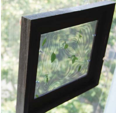
hanging herb drying