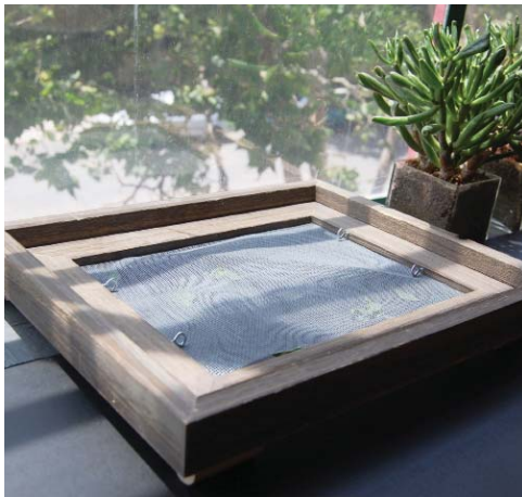
table top herb drying